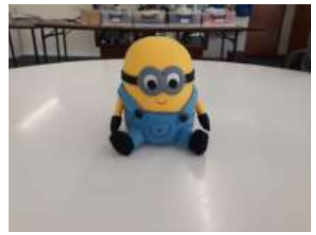
Reindeer/ Christmas Fairies/Minion – Eunice Mcleod