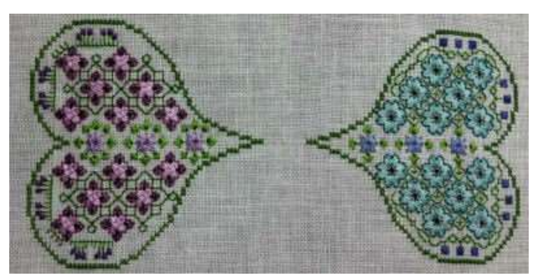
By Catrina R., WA, USA

We start our World Trip in England, with an adaptation of 'Norwich' stitch, then we travel north to discover 'Berwick' stitch and a composite 'Wessex' stitch named after the Island of Lindisfarne. We then cross over the border to work 'Scotch' stitch.